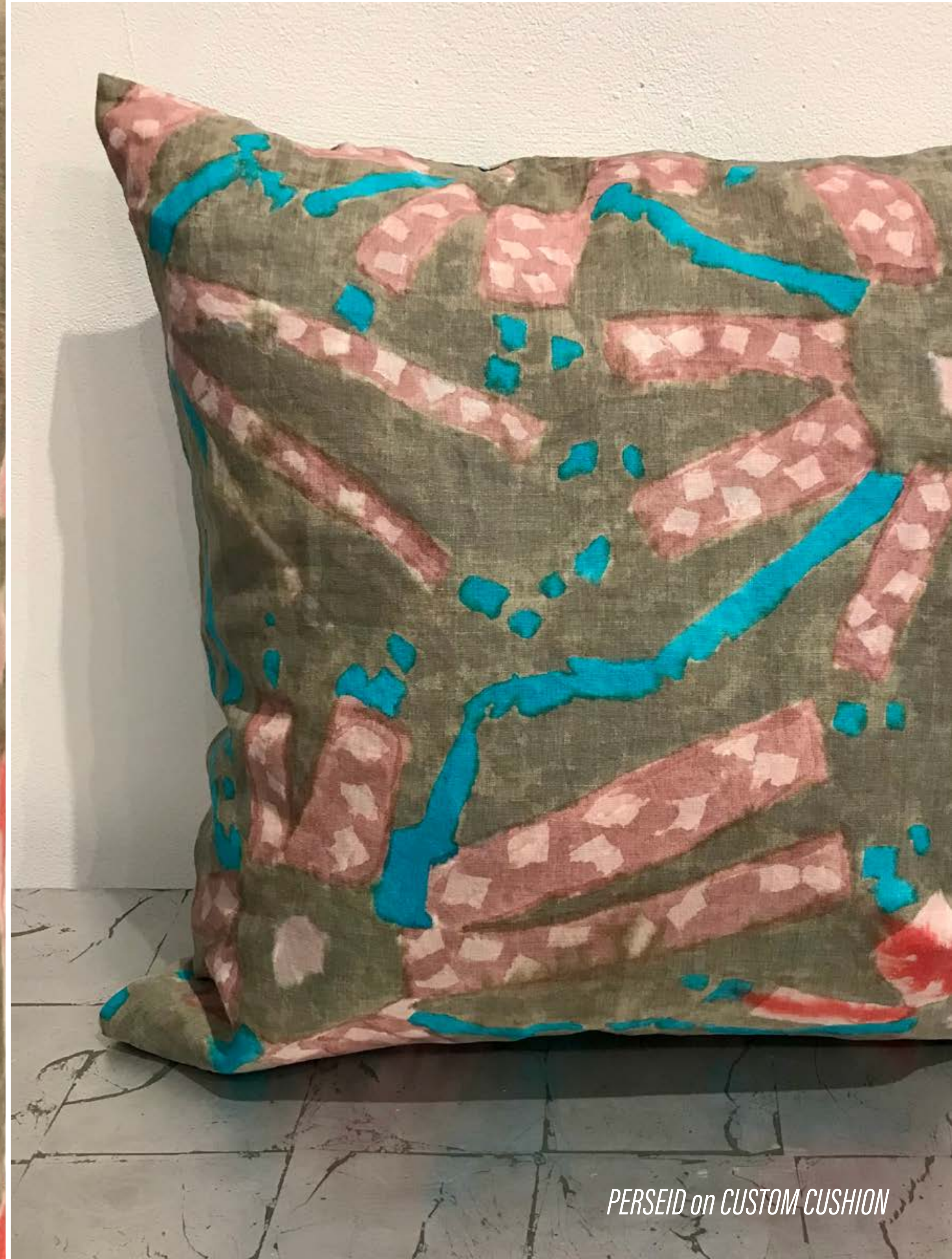
PERSEID on CUSTOM CUSHION