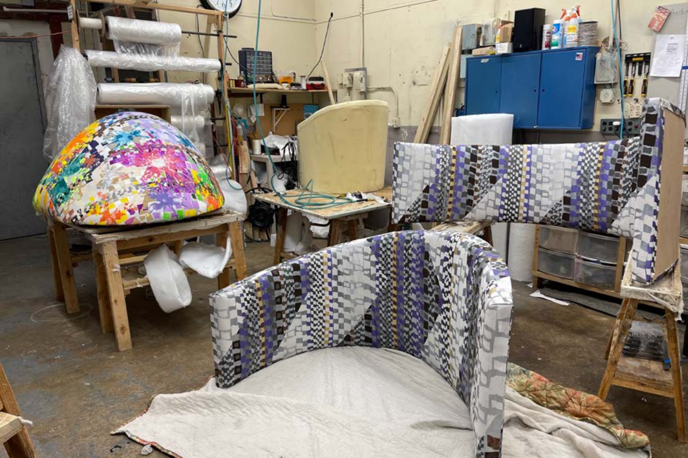
CUSTOM PROJECT FOR PERKINS EASTMAN 2022