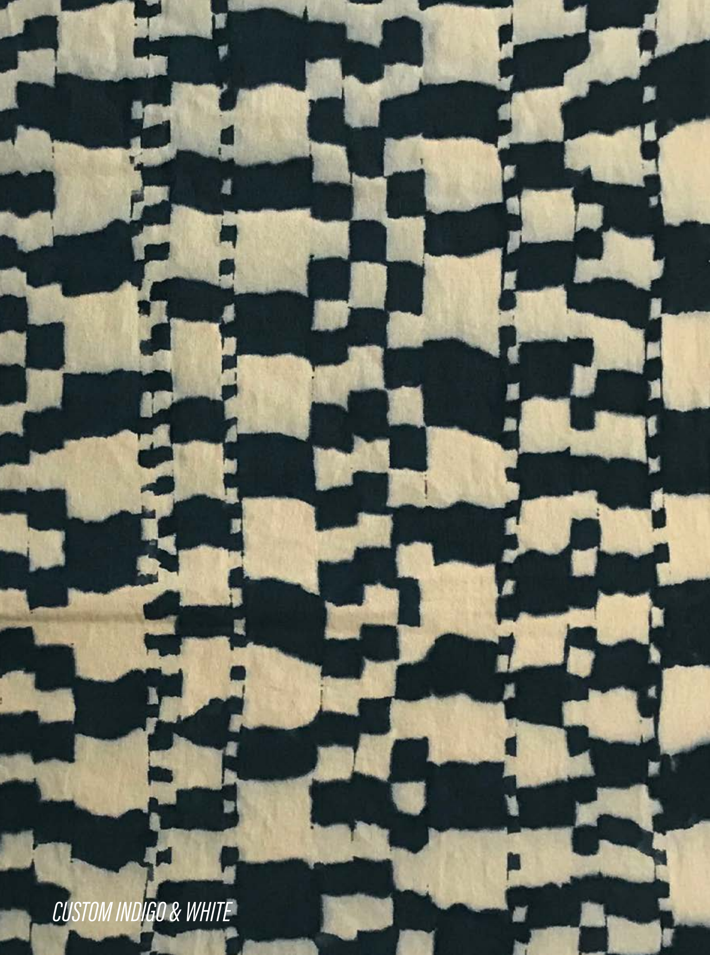
CUSTOM INDIGO & WHITE