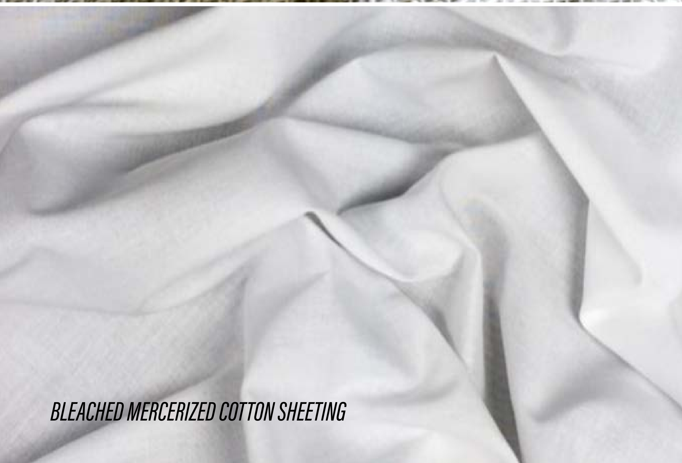
BLEACHED MERCERIZED COTTON SHEETING