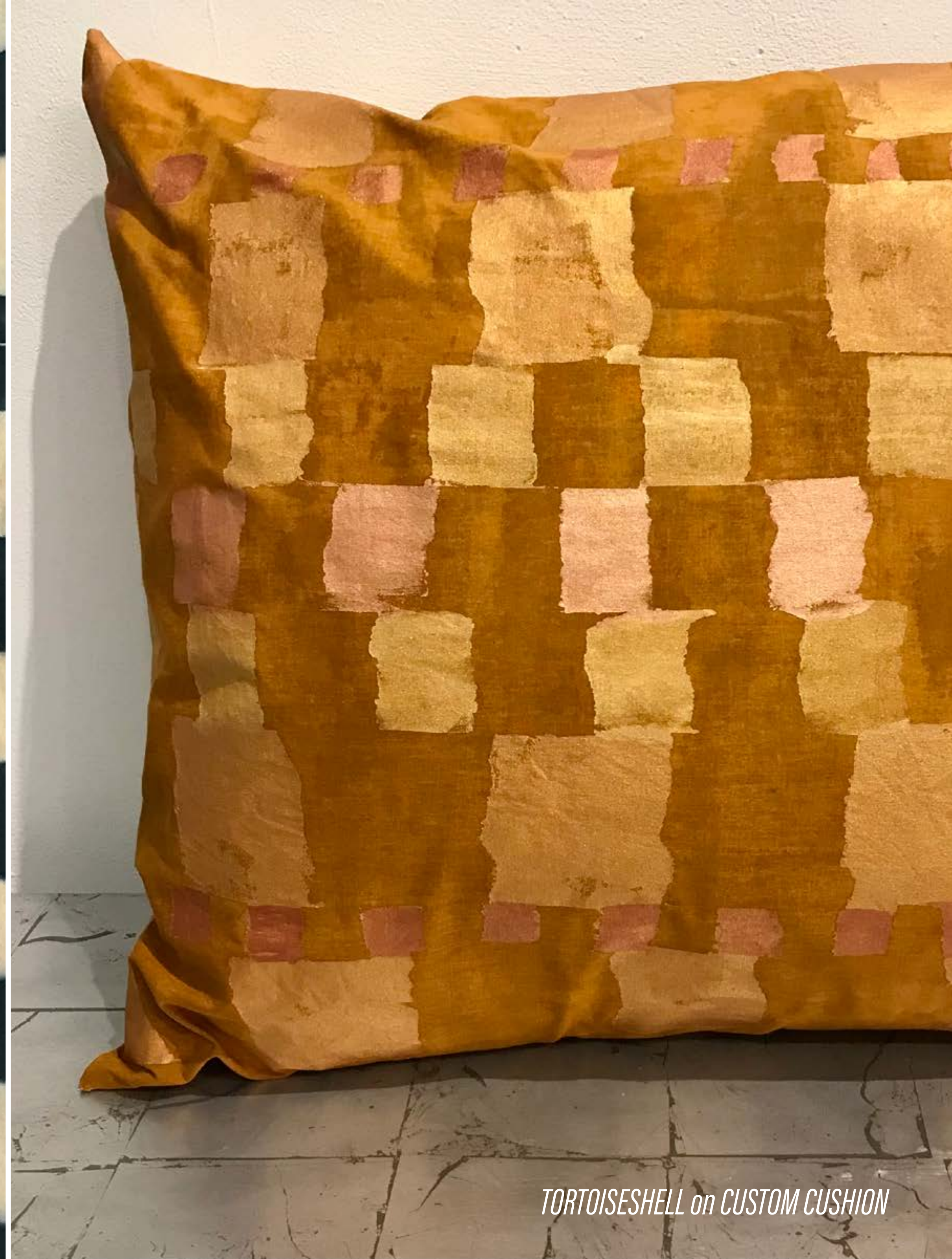
TORTOISESHELL on CUSTOM CUSHION