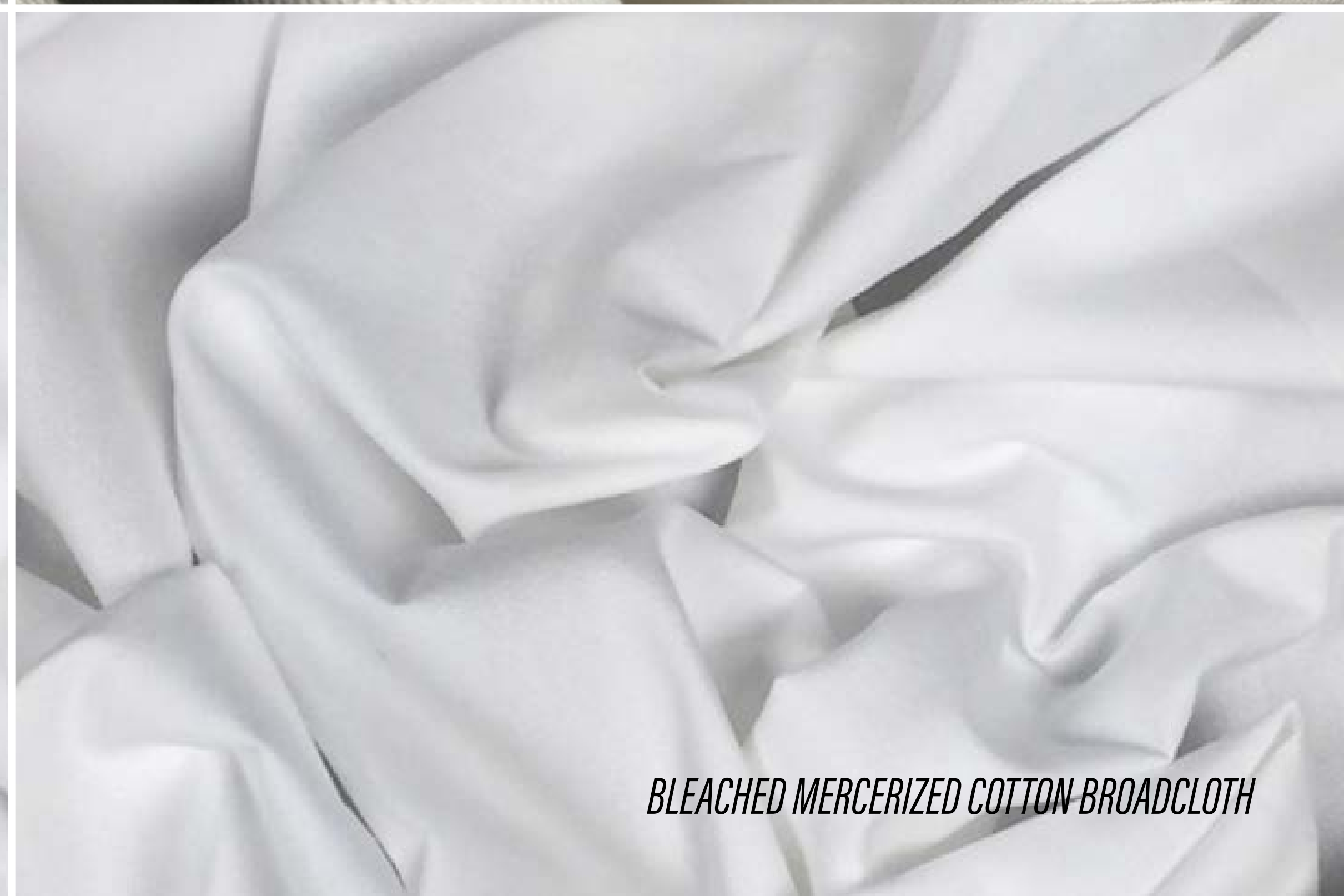
BLEACHED MERCERIZED COTTON BROADCLOTH